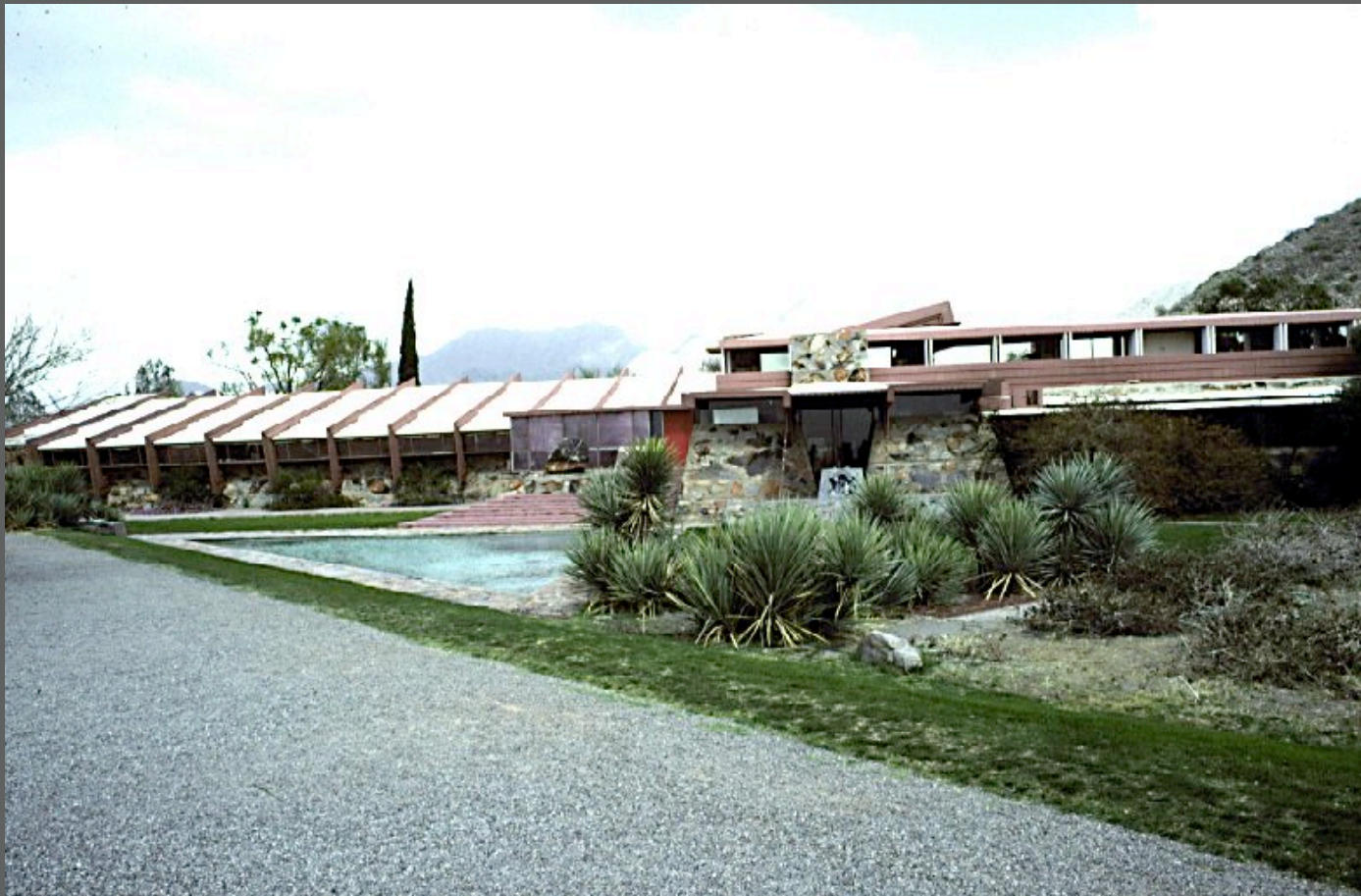
Taliesin West (Frank Lloyd Wright)